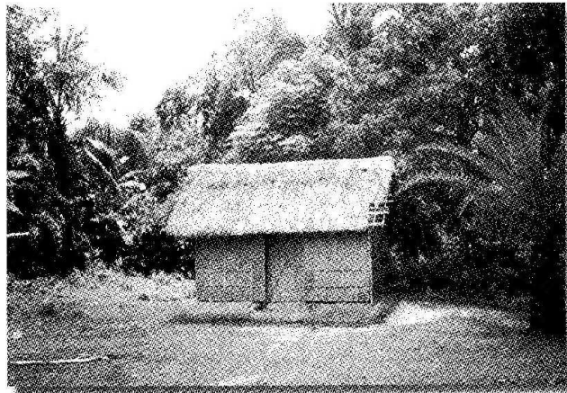
Figure 4 : Thatch-Bamboo shelter

Under severe circumstances, only Plastic or Polythene sheets may be distributed. The users scavenge bamboos, poles and branches to make a framework to which the sheet is fixed with rope or wire, if available. Relative merits and demerits of plastic sheeting have already been presented. A major disadvantage of not providing framework material is that deforestation at those localities will happen.