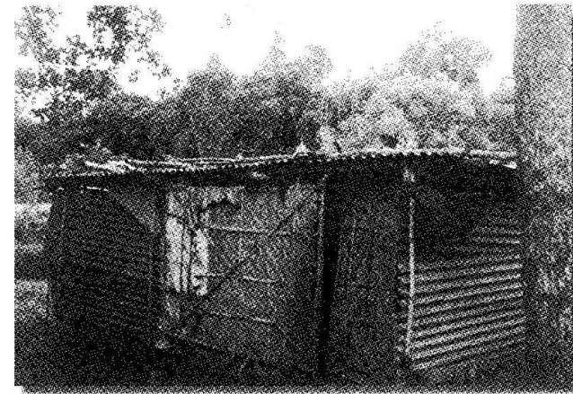
Figure 3 : C.I sheet-Bamboo shelter

In this option, a complete package of materials is supplied for the erection of a low-cost house with Corrugated Iron (C.I.) sheet roof with wooden or bamboo roof support and bamboo poles, and with bamboo fence side walls. Fig. 3 shows photograph of C.I. sheet-bamboo shelter. Advantages include ability to store and transport quite easily, availability of materials in local market, strength and durability, repairable locally, familiarity to local people, fire resistant, re-usable, galvanizing when new reflects sun's heat which however fades away in a few months. Disadvantages include requirement of additional tools for erection, danger of C.I. sheets fixed insecurely being flown away like giant flying blades in a major storm, susceptibility to damage in saline conditions, heat gain in hot weather. C.I. sheets are not normally marked by numbers and cannot be tracked. The critical element in such a housing would be to provide proper securing mechanism of the C.I. sheet with the framework.